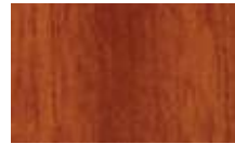
11. Glossy Natural Mahogany