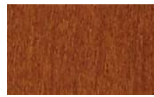
03. Standard-Stained Cherry