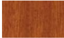
09. Natural Mahogany