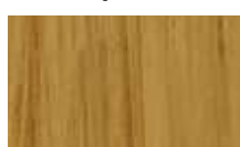
38. Blond Oak