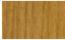
05. Natural Ash