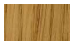
44. Light Oak

*Other colors: according to customer samples, on request