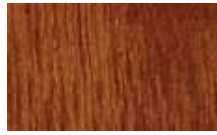
06. Natural Iroko