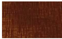
02. Stained Iroko