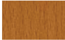
10. Steamed Beech