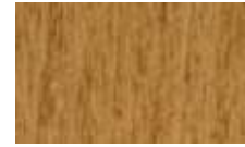
08. Raw (Cut) Beech