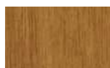
31. Medium Light Tanganyika