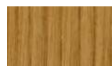
36. Natural Chestnut