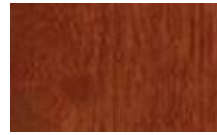
07. Medium Mahogany