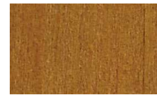
04. Stained Pine