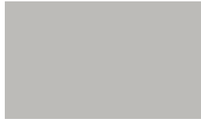
46. Lacquered - Ivory