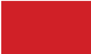
48. Lacquered - Red