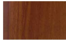
61. D.P. American Walnut