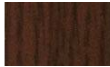
64. D.P. Wenge

*Other colors: according to customer samples, on request