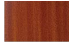
62. D.P. Mahogany