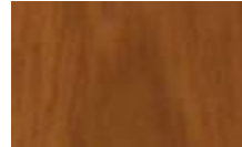
53. D.P. Medium Tanganyika