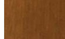
54. D.P. Plank Walnut