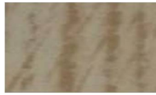
55. D.P. Bleached Oak