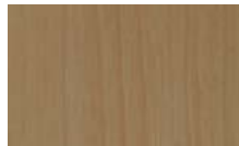
60. D.P. Beech