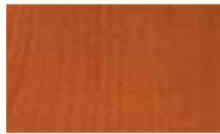
59. D.P. Cherry-Stained Tanganyika