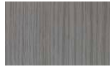
57. D.P. Light Grey Oak