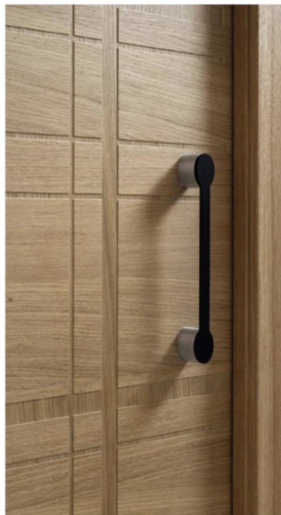
Pantographed ART DESIGN plywood (examples)