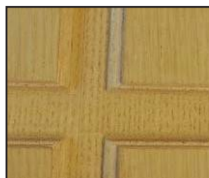
Pantographed raw plywood (example)