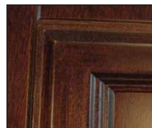
Pantographed and painted plywood (example)