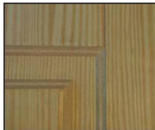
Pantographed raw plywood (example)