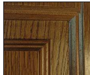
Pantographed and painted plywood (example)